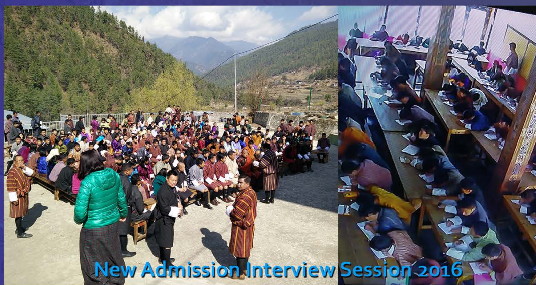
New Admission Interview Session 2016

This years' CTAS new admission interviews were held on the 10th March 2016 in the school premises. A total of 115 students came for the admission test, applying for 28 vacancies ( 13 boys & 15 girls). Due to lots of pressure from the students especially those coming from very far away places the school admitted 5 additional students, making it a total of 33 students (18 boys & 15 girls) for 2016. Now we have a total of 145 students (96 boys & 49 girls) studying in our school.