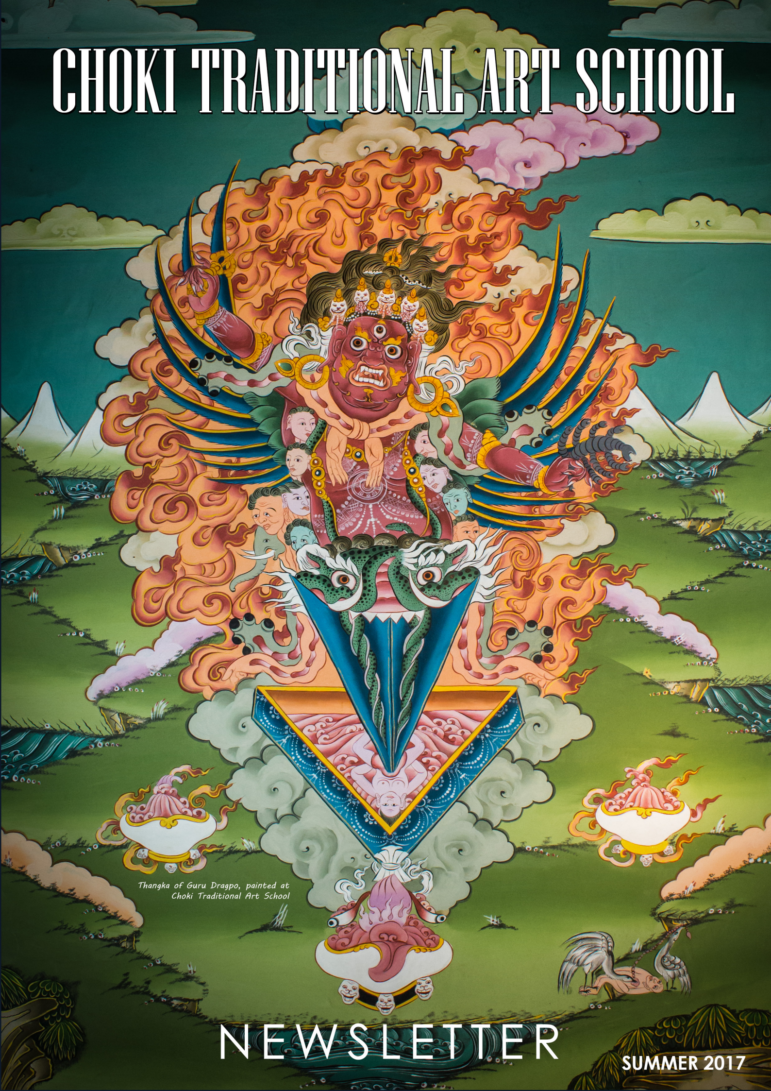
Thangka of Guru Dragpo, painted at Choki Traditional Art School