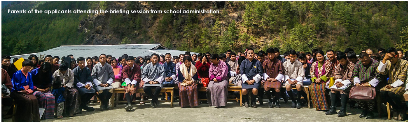
Parents of the applicants attending the briefing session from school administration

36 boys including 18 day school students and 19 girls, making it a total of 55 students newly admitted in 2017. Now we have a total of 165 students (49 girls and 116 boys) studying at our school.