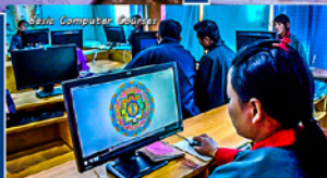
Basic Computer Course