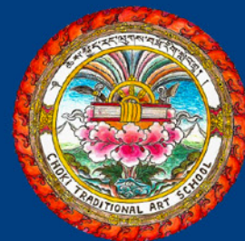
The School's Logo

Academic Session: March - December of each year