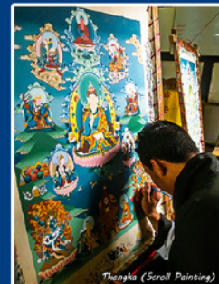
Thangka (Scroll Painting)