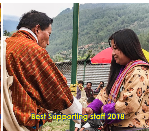
Best Supporting staff 2018