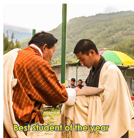
Best student of the year