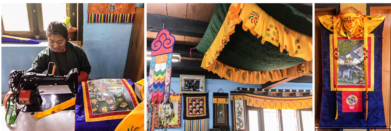
2. Religious items/Choezay (Thanka, Chubu Gyltshen, Ten Khep, Gyltshen)