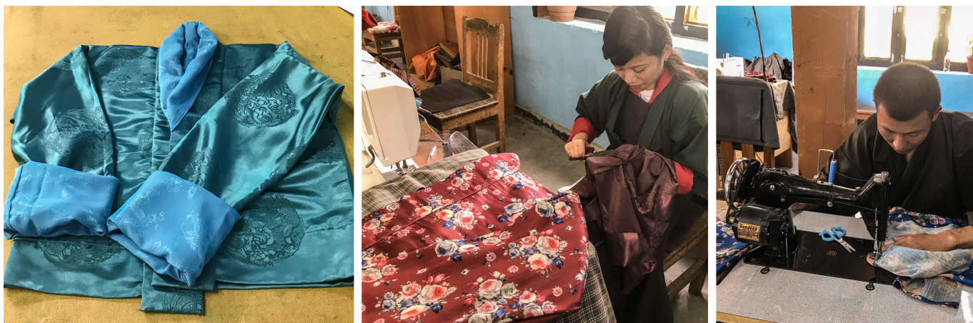
1. Traditional dress making (Kira, Tego & Wonju)

For the first time, the tailoring course has been provided with a specialization program that aims to ensure better employability of the graduating students who have completed their two years' program. The program was created based on feedback received from the students, who expressed their concerns of the lack of in-depth knowledge of specific fields which may then pose difficulties in entering the job market. Therefore, the school has started providing specialized options from this semester onwards. The feedback we received were very positive and encouraging. We also hope to improve the quality and standards by adopting and implementing standard measurement sizes such as medium, large and extra-large. The categories that are aligned with the market requirement are as follows: