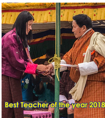
Best Teacher of the year 2018