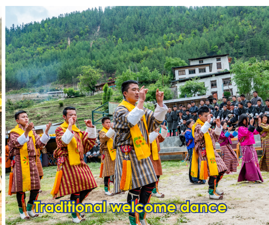
Traditional welcome dance