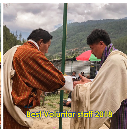
Best Voluntar staff 2018