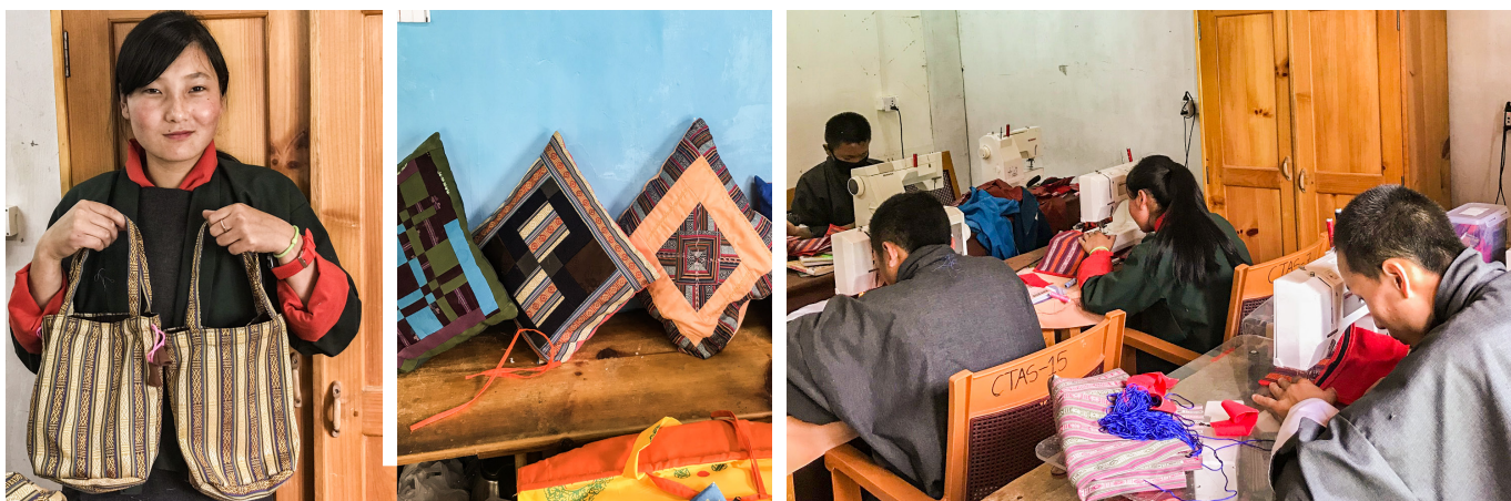
3) Souvenir Creativity (Handbag, Purse, Cushion cover, Bed Runner, Table Runner etc)