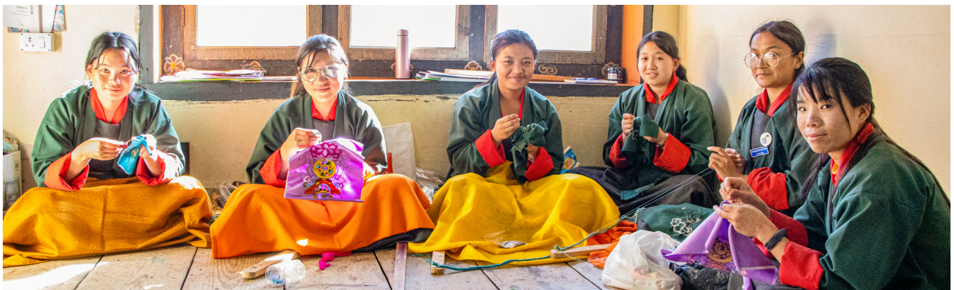
Sangay's happy students (embroidery level 2)